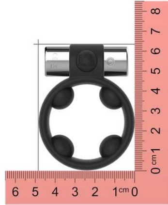
High: 63mm Wide: 48mm Size for: 24-38mm